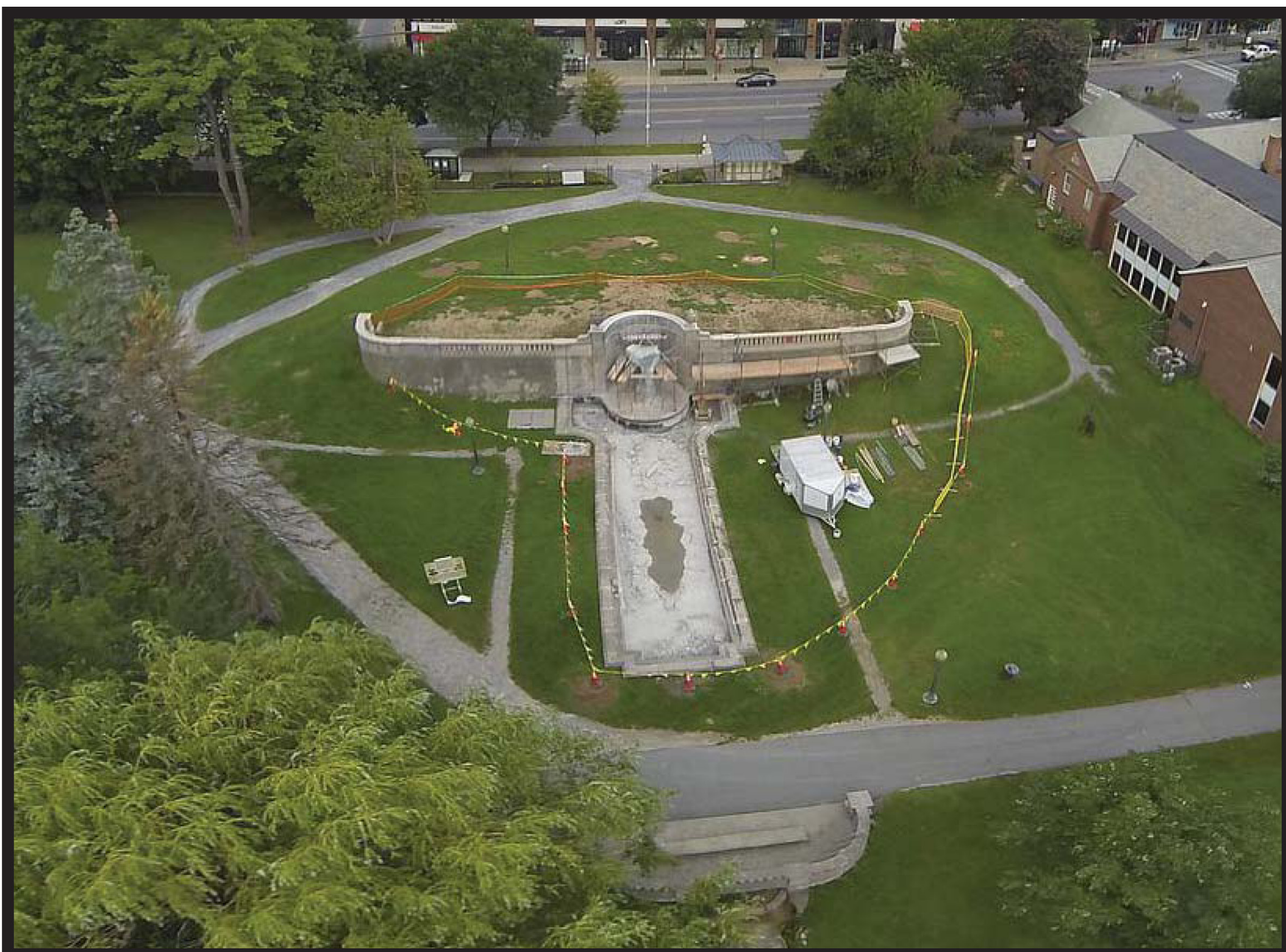
Aerial View of the Memorial's Work in Progress of 2014