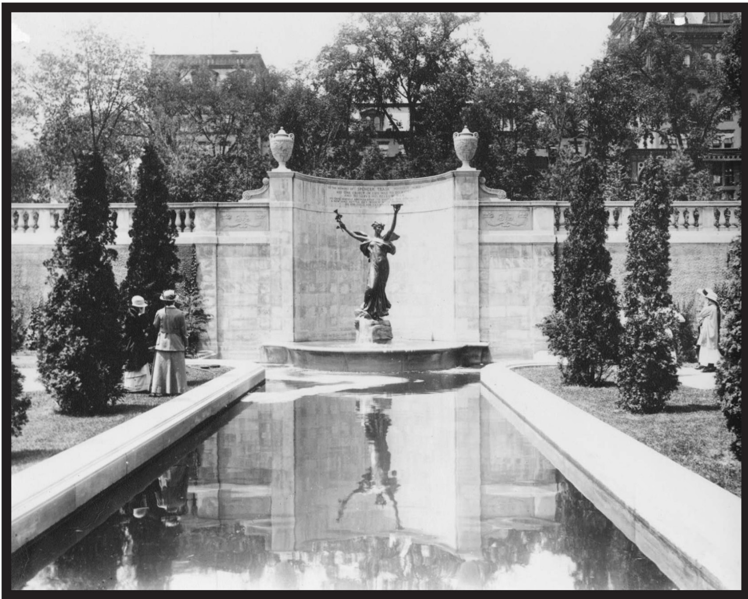
Spirit of Life Memorial circa 1920

Elan Planning, Design and Landscape Architecture, PLLC In Partner With Martha Lyon Landscape Architecture, LLC