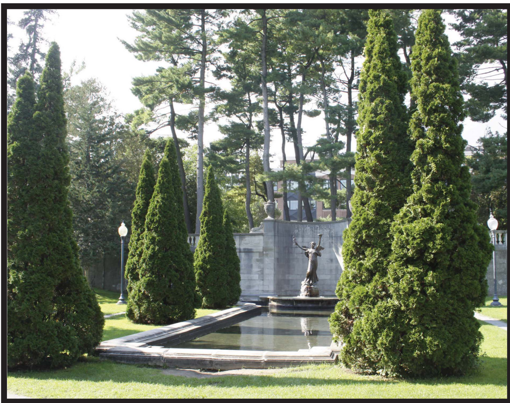
Memorial Condition Prior to Restoration 2013