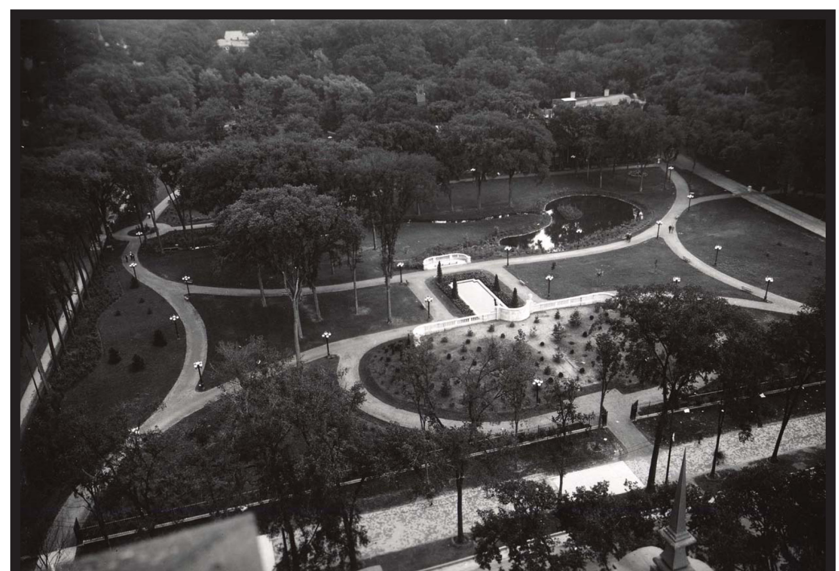
Aerial View of the Memorial 1914